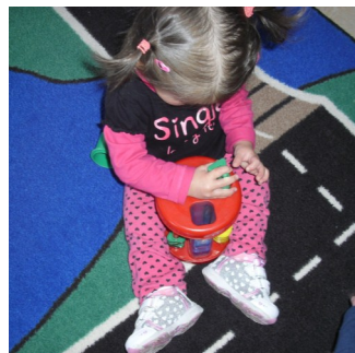
Cierra is practicing her fine motor skills and learning colors and shapes!